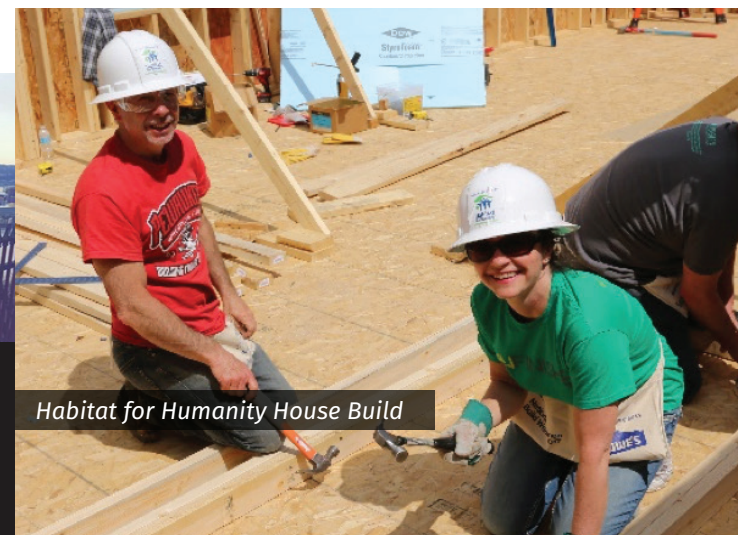
Habitat for Humanity House Build

Visit www.riverglen.cc/love-waukesha/ to sign up!